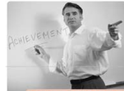
Distinguished Club Program and Club Success Plan