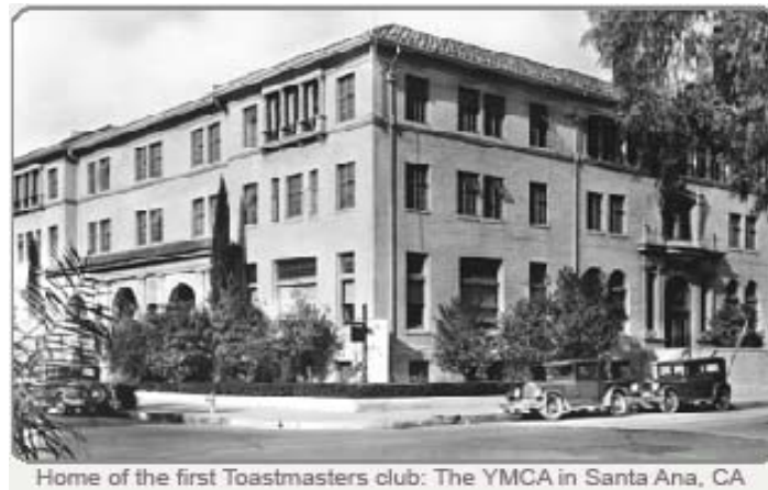
Home of the first Toastmasters club: The YMCA in Santa Ana, CA