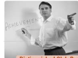
Distinguished Club Program and Club Success Plan